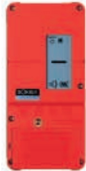
Display on reverse face