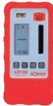
Fitted with Protector LRP1